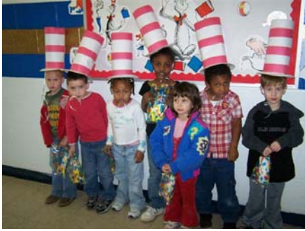
Pre-K students celebrate Dr. Seuss' birthday.