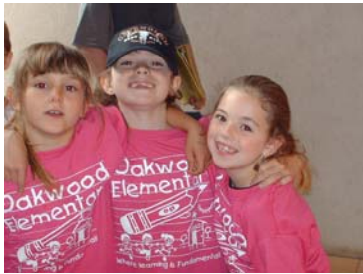
First grade enjoys their AR Trip.